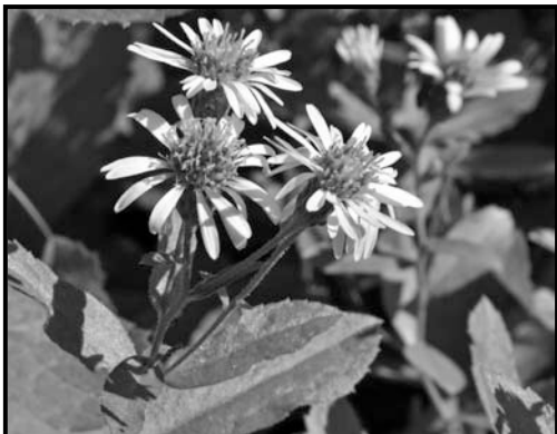
Roughleaved Aster – Photo by David Schoen

Asters are important late season sources of nectar for butterflies. Our asters also provide food for butterfly larvae. California aster is a larval host plant of the field crescent butterfly ( Phycodes campestris ). Roughleaved aster and other aster family members such as goldenrod are larval host plants of the northern checkerspot butterfly ( Chlosyne palia ).